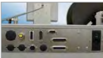
Split back panel for easy access