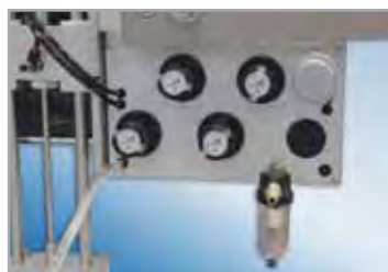
Regulators with built-in pressure gauge