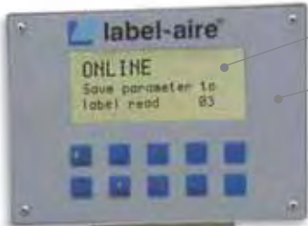
R3 digital display