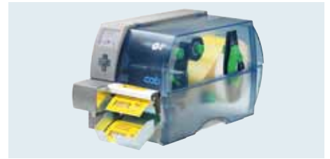
Blade and collecting box