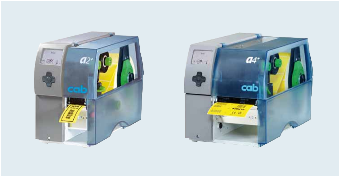
From narrow to extra-wide.