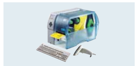
Stand-alone operation without PC