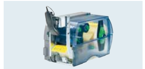
Test device for linear barcodes