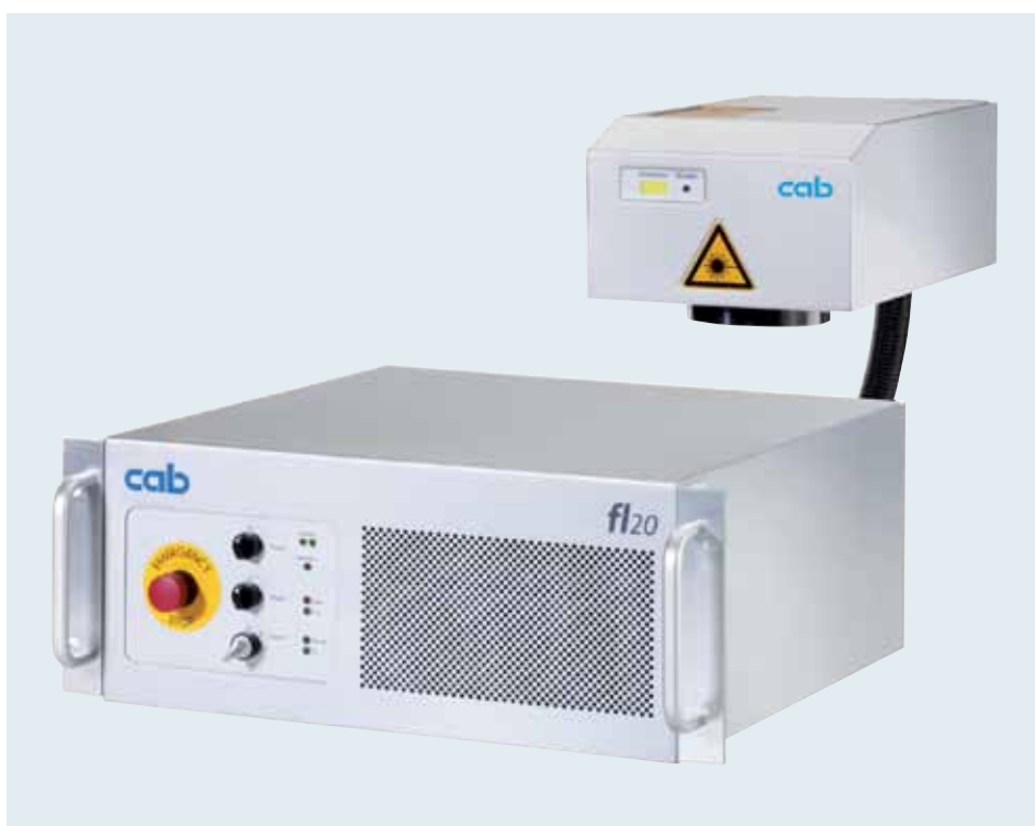
Innovative, economical, precise and fast – the leading diode-pumped fiber lasers from cab.