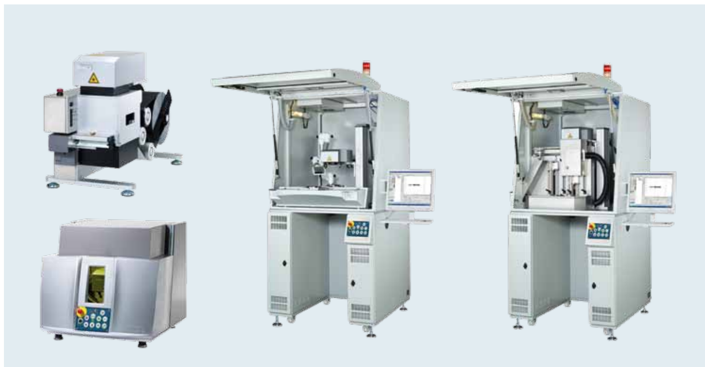
Top left: Label Marker, bottom left: Laser safety housing LSG 65, middle: Laser safety housing LSG 100 with round table module RTM 650, right: Laser safety housing LSG 100 with type plate handling THS 4.2