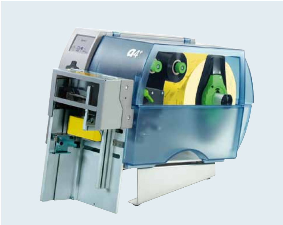
Printer with stacker.