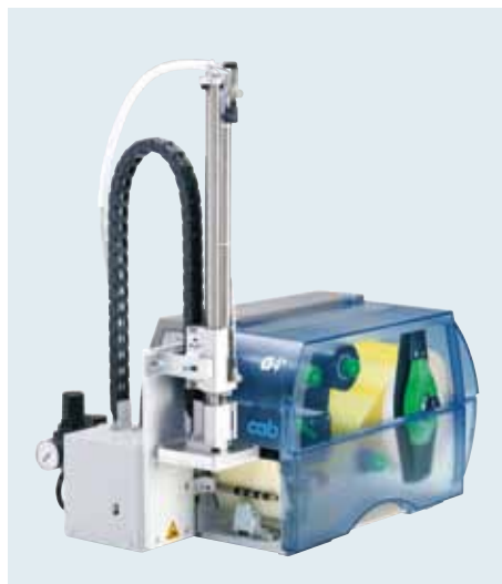
A1000 applicator for real-time labeling

We also offer CF storage cards and keyboards for printing labels in stand-alone mode without a PC. Comprehensive control options from all popular interfaces.