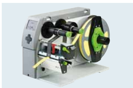
Centered material feed

Please refer to our product catalog for the complete technical specifications or go to www.cab.de/en/a4plusm